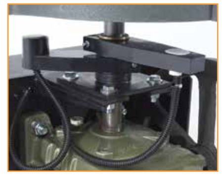
easily adjustable electronic magnetic limits