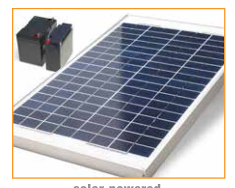
solar powered panel and battery options available